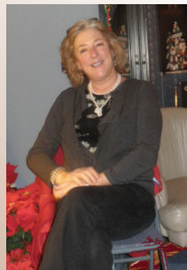
"OK, I'm ready...let's open gifts"