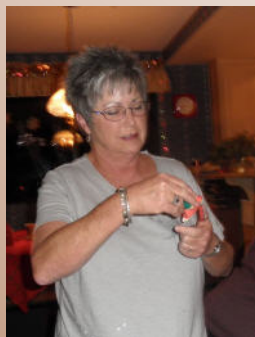
"How the heck do you work this??"